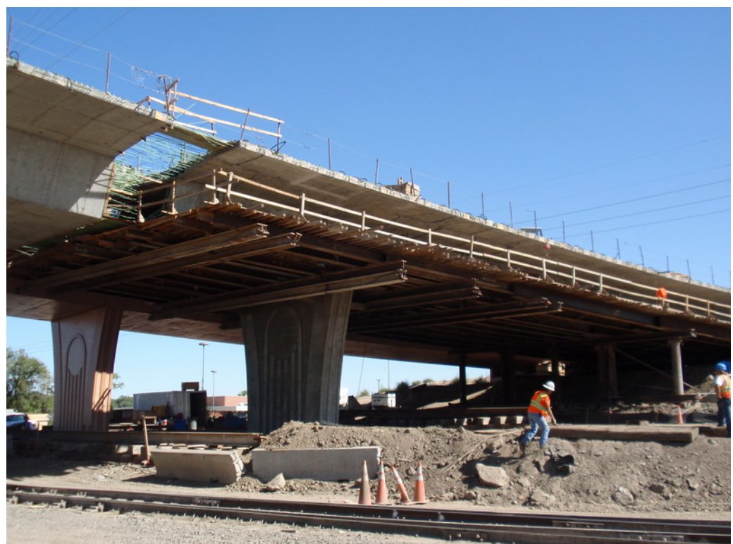
Page 1 of 6