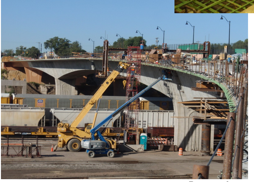
Figure 5 – Span 4 EB Closure Segment Construction – September 17, 2010:

Following casting of the closure segment and stressing one pair of draped tendons, a crew disengages the stability prop and de-tensions the horizontal PT bars in the prop diaphragm. Staining operations have begun in Span 1 EB in the background.