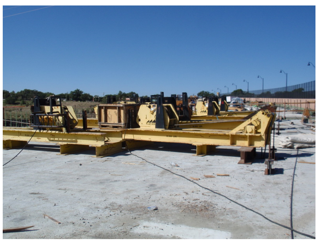
Figure 1 – Span 5 EB CIP Superstructure Construction – September 3 2010:

Flatiron Constructors Intermountain completed superstructure construction of the eastbound structure with casting the final closure segment, Span 3 EB. The following is a summary of the construction progress for the last month.