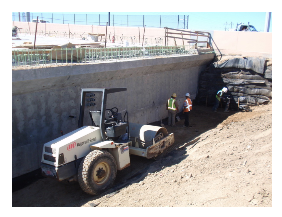
Figure 7 – Abutment 6 EB Construction – September 24, 2010: After stripping the backwall forms, the structural backfilling begins at Abutment 6 EB.