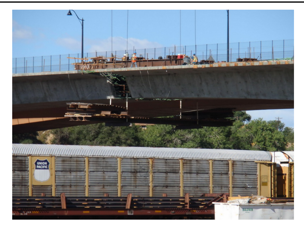
Figure 6 – Span 3 EB Closure Segment Construction – September 23, 2010: The closure forms are hoisted into position using PT bars at Span 3 EB closure segment.