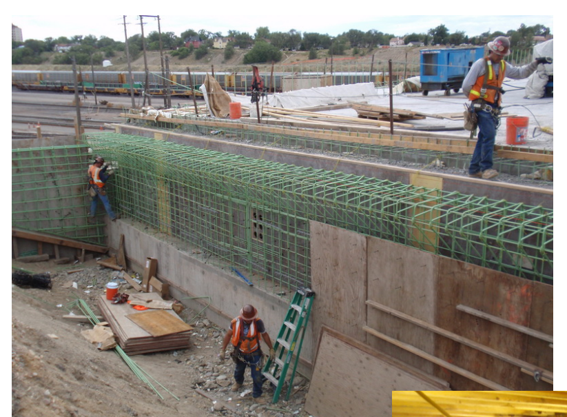
Figure 3 – Abutment 6 EB Construction – September 13, 2010:

The ironworkers install the reinforcing for the backwall and wingwall at Abutment 6 EB.