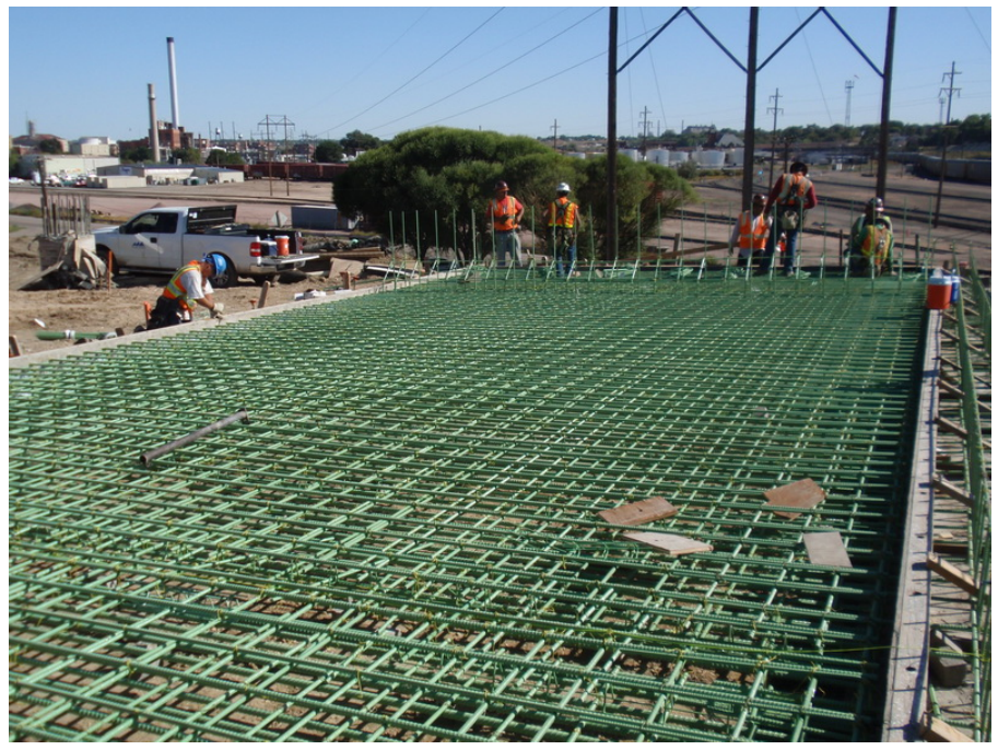
Figure 9 – Abutment 6 EB Approach Slab Construction – September 30, 2010:

The ironworkers finish off the installation of the approach slab reinforcing at Abutment 6 EB.